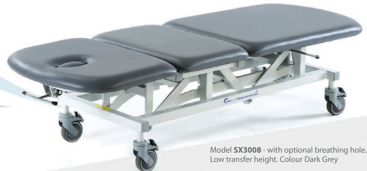
Model SX3008 - with optional breathing hole. Low transfer height. Colour Dark Grey