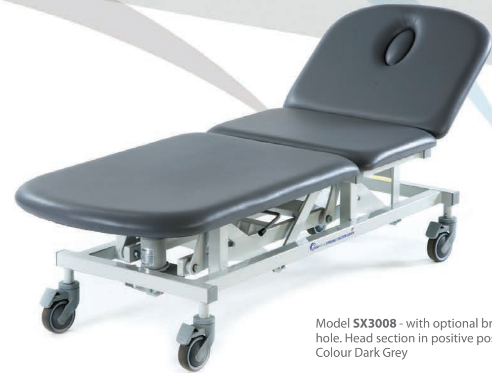
Model SX3008 - with optional breathing hole. Head section in positive position. Colour Dark Grey