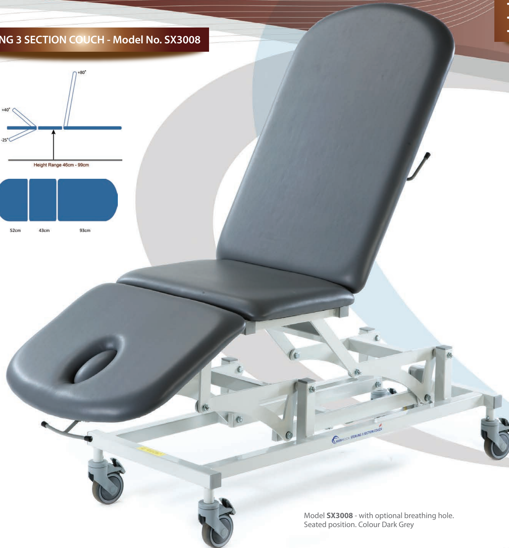
Model SX3008 - with optional breathing hole. Seated position. Colour Dark Grey