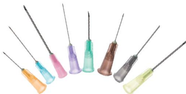
Figure 1: BD Microlance™ 3 Needles