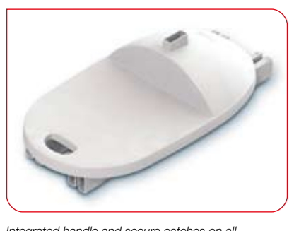
Integrated handle and secure catches on all individual parts for transport ease.

Adjusting the smooth-running measuring slide is extremely easy due to the large head plate. A further sophisticated detail is that, as the scale is printed along the side of the measuring rod, it is easy to read off the result while measuring, thus guaranteeing precise results - up to a height of 207 cm.