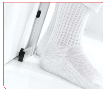
The foot positioner ensures exact positioning and precise measurements.

The telescoping function ensures that readings are always at eye level, for accurate readings regardless of the angle from which one looks. The seca 222 comes with an attachable headpiece for accurate head adjustment. When not in use, the measuring slide can be folded down for safety.