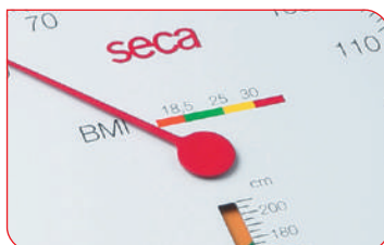
It is easy to determine BMI with the colorcoded dial.