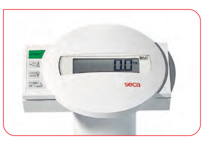
All it takes is the press of a key to find out BMI.

The seca 769 is extremely energy-saving and thus very cost-effective. The minimum power consumption of the lowmaintenance column scale ensures that a large number of weighings are possible with just one set of batteries. The automatic switch-off function is another reason for the low energy consumption.