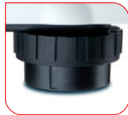
Leveling base on the bottom of the scale base for safe and secure placement.