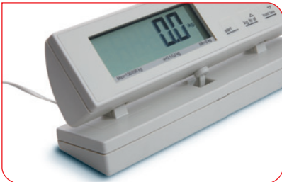
Infinitely adjustable tilt angle in display and operating element for installation on a desk or wall.