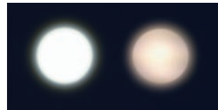
LED VS. HALOGEN

By utilizing 5,500K white Light Emitting Diodes (LEDs) as opposed to halogen lamps, the Green Series Medical Exam Lights will provide you with a superior, white light that is significantly brighter than halogen, resulting in an overall improved exam by allowing for enhanced visualization of the exam area, true tissue color rendition, and a uniform spot—no dark or hot spots. And our white LEDs have industry-leading lumen performance and 50,000 hours of life.